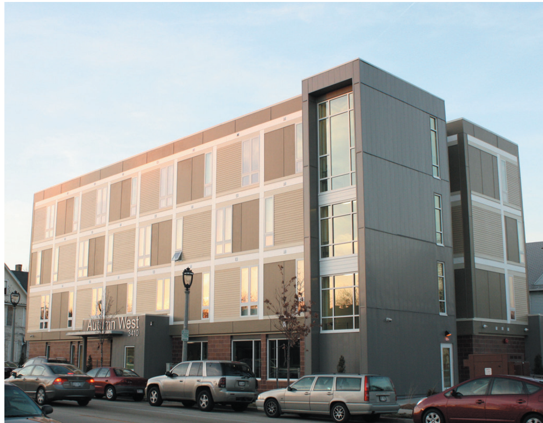
Autumn West provides short-term housing and services to single adults who are homeless and facing mental illness. Its supportive environment promotes self-reliance, enabling residents to take responsibility for stabilizing their mental and physical health, and financial situations.